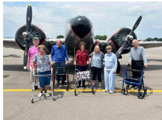
A beautiful bunch on Tuesday July 8 from Clarendale Of Addison, memory care facility.