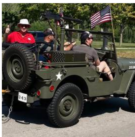
Our sponsored Scout Troop 35

ILLINOIS AVIATION MUSEUM AT BOLINGBROOK'S CLOW INTERNATIONAL AIRPORT WEDNESDAY, JULY 3 7:00 PM