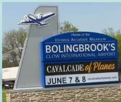
BOLINGBROOK'S CLOW INTERNATIONAL AIRPORT CAVALCADE of Planes JUNE 7 & 8