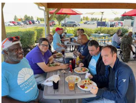
lunch at Charlie's