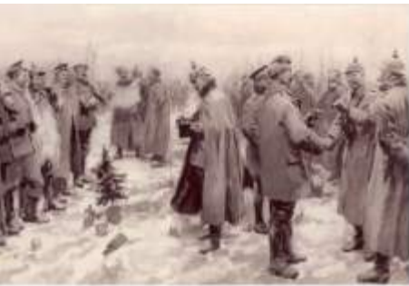
Christmas Truce | Facts & History The Christmas Truce, (December 24-25, 1914), an impromptu cease-fire that occurred along the Western Front during World War I. The pause in fighting was...

These impromptu parties took place in various locations along the front with some even lasting several days. The following day the fighting resumed and a Christmas truce would never occur again.